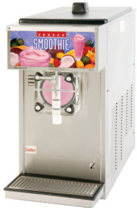
MODEL 5311 or 5511

Grindmaster's Crathco 5000 Series Electronic Control Beverage Freezers are ideal for serving smoothies, shakes, frozen cappuccino, cocktails, granitas, and a variety of other frozen beverages.