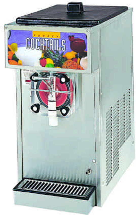
MODEL 3311 or 3511